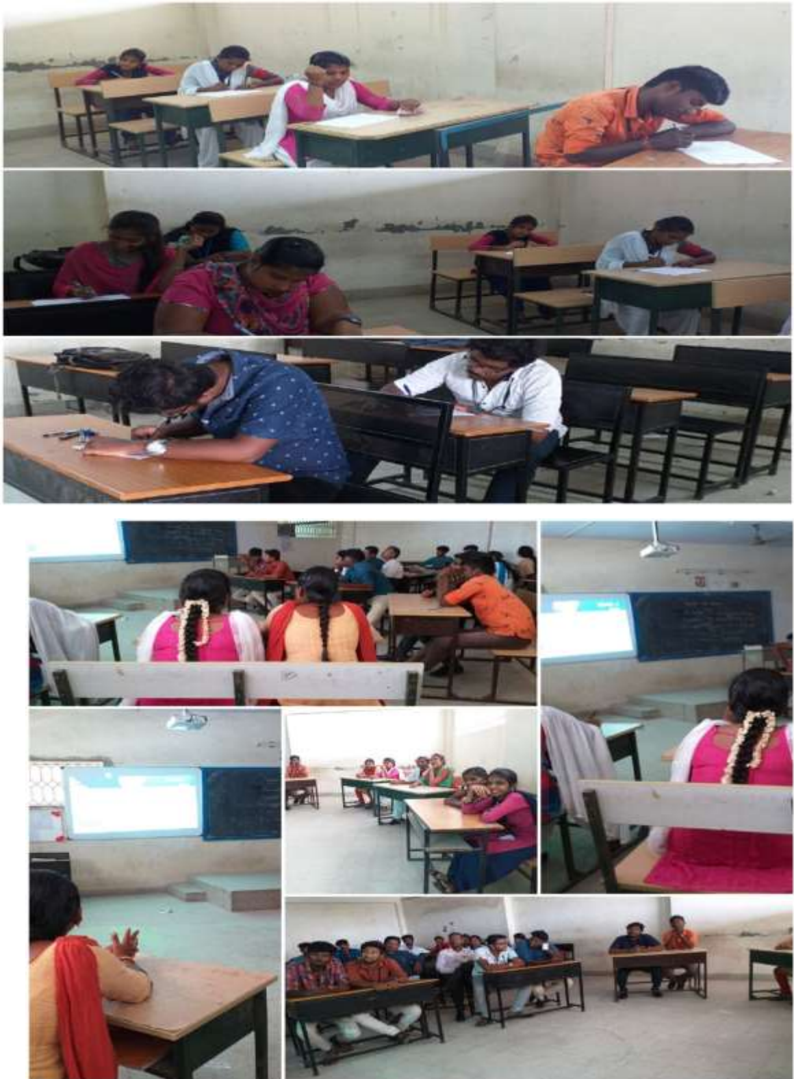
Quiz Competition - Prelims & Main – 3.03.2020