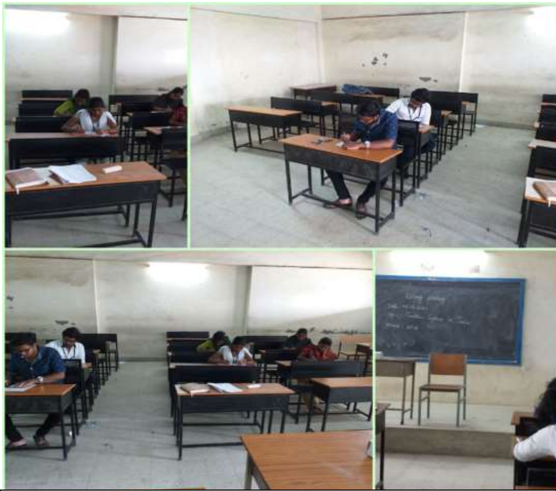
Essay Writing Competition – 2.03.2020