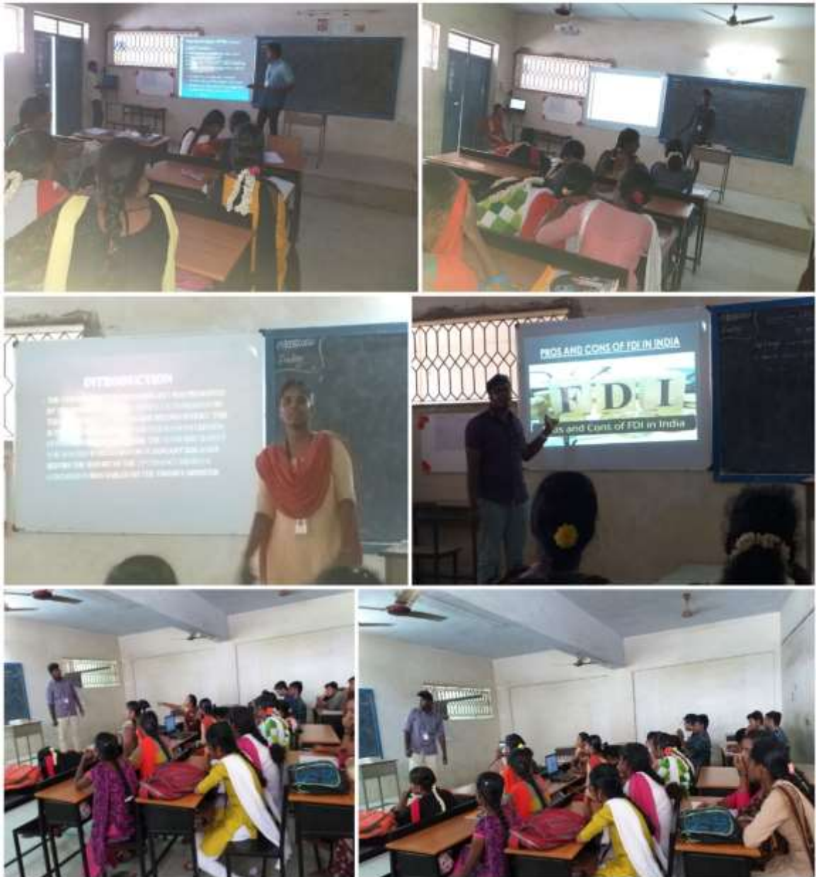
Paper Presentation Competition - 13.03.2020