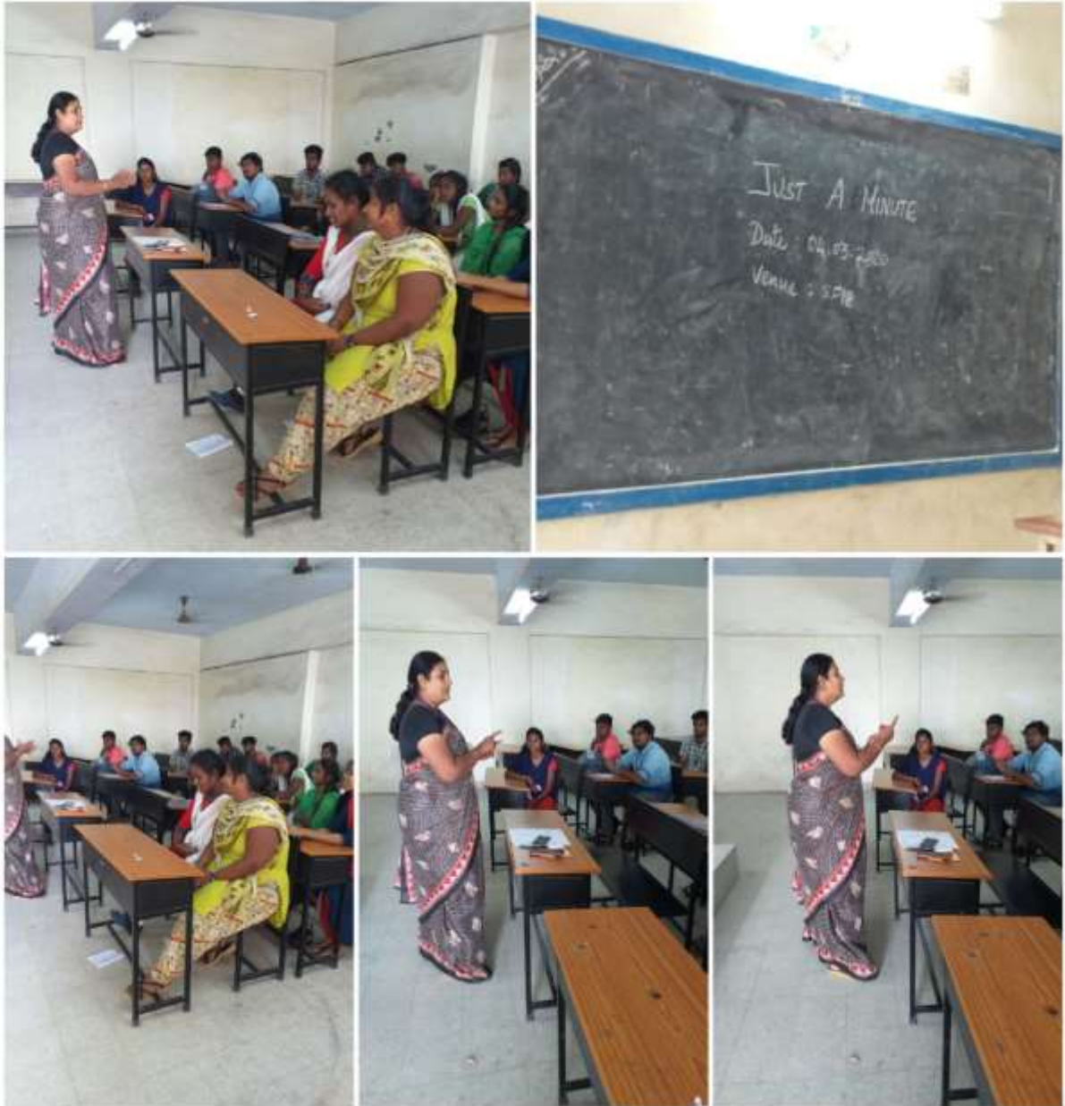
Just A Minute Competition - 4.03.2020